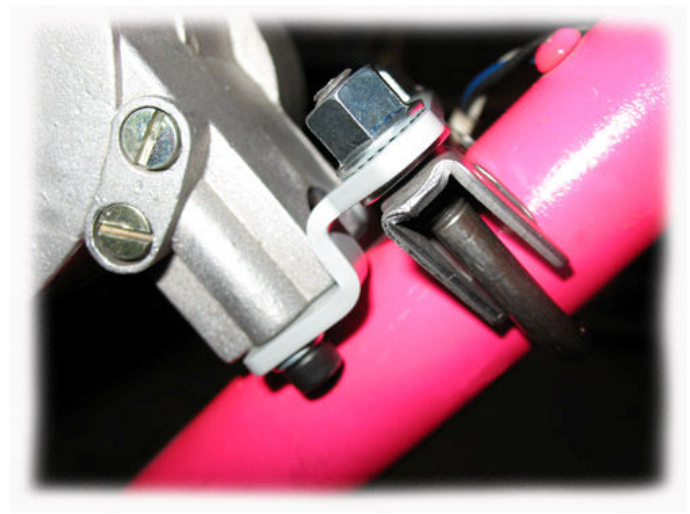
This method allows the most space savings